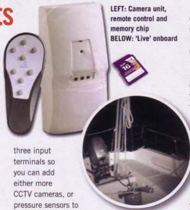
LEFT: Camera unit, remote control and memory chip BELOW: 'Live' onboard

Incorporating camera, motion sensor and MMC card, the main unit resembles a smoke detector, so will probably go unnoticed by an intruder – but if you want to foil a heist you can set it to trigger an audible or visible alarm upon detection. Memocam includes